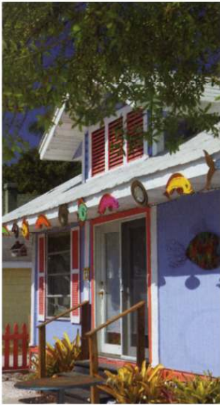
▶ Village of the Arts