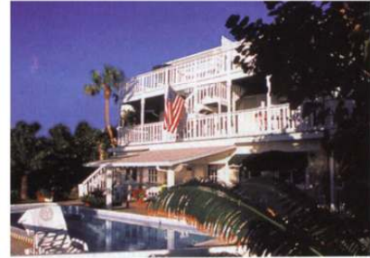
▲ Harrington House Bed & Breakfast