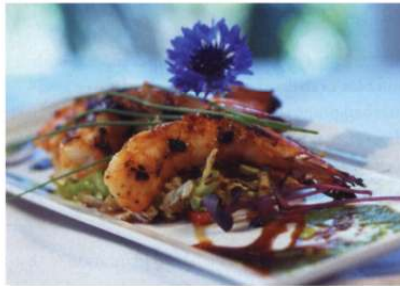
▲ Beach Bistro Restaurant