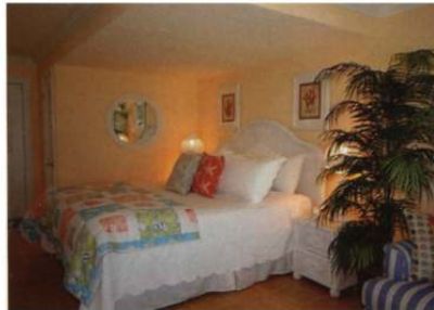
▲ The SeaSide Inn & Resort