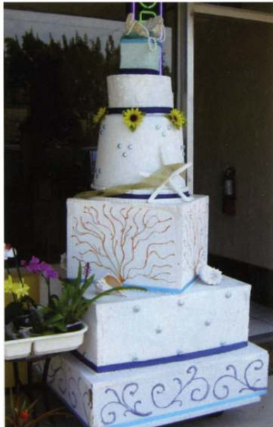
▲ Matt & Dom's Pastry Café