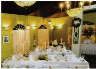
▲ The Sun House - Formal Setting