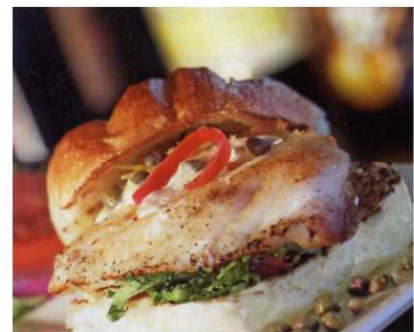
▶ Beach Bistro Restaurant

Anna Maria Island is made up of three townships, Bradenton Beach, Holmes Beach and Anna Maria and all work closely together to provide an enjoyable adventure and accommodate the needs of your friends and family. Accommodations range from private beach houses to multi-unit condos to intimate inns or B&B's. One notable inn is the SeaSide Inn Beach Resort in Bradenton Beach, with one of the best private beach locations on the island. The SeaSide Resort is an intimate charming inn with cozy beach front rooms or two and three bedroom studios complete with kitchenettes. All rooms have private patios over-looking the gulf and an unobstructed view of the magnificent sunset with access to lounge chairs, umbrellas and grills. Once you check-in you won't want to check-out. The Harrington House Beachfront Bed & Breakfast Inn located in Holmes Beach is a historic 1925 home that takes you back in time and reminds you of the elegant southern plantation homes but located