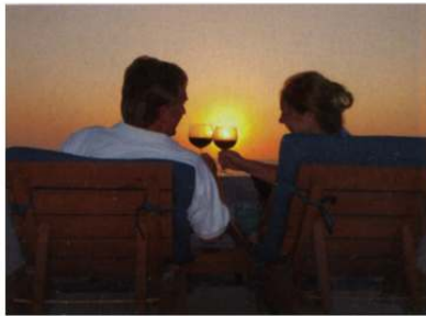
▲ The SeaSide Inn & Resort - Toast at Sunset

Anna Maria Island Art League 941.778.2099 IslandArtLeague.org