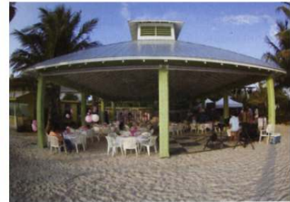
▲ The Sandbar Restaurant