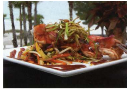
▲ The Sun House Restaurant